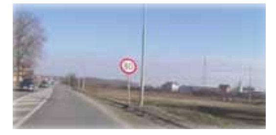
Figure 2. Iron poles in the speed limit zone of 80km/h (M16.1).

In Figure 3. we can see an example from a real life situation. That even if the speed limit is 80km/h the poles are located very close to the edge of the driveway and extend on the right and left side of the road to the entire length of the segment of the specified speed limit. [7]