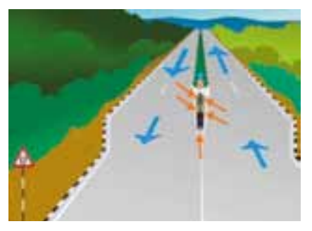
Figure 11. M16 example situation

On the road reserved only for the traffic of motor vehicles M16 there are several New Jersey barriers whose beginnings are not protected in any measure and some of them have already traces of vehicle imapcts. Since speeds on this road are more than 100km/h, adequate protection and prevention of catapulting vehicles in the event of a collision is a must have thing. [11]