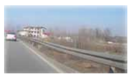
Figure 5. Poor maintenance (M16.1)

The approaches and the fences on the bridges are also one of the critical points on the observed section. There are openings between the protective fences on the bridges and the frontal rebound fences. And in this case, the ending of the rebound fence is in most cases open. As far as the protective fences on the bridge are concerned, they are mostly in poor condition or not present on one or both sides. The approaches to the zones of the bridges are not adequately protected. The rebound fences, if any, do not protect vehicles from possible landings in slopes in the zone from 20 to 50 meters before the bridge. They are placed before the beginning of the bridge or are not at all positioned.