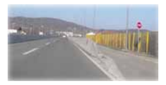
Figure 7. Unprotected new jersey barrier (M16.1)

New Jersey barriers are present only on the road reserved only for the traffic of motor vehicles M16 Banja Luka - Klašnice. Their function is to physically separate the driveways. In the majority of cases, one line of these barriers is enough but there are two lines on the M16 path for reasons that are not defined. Roadside disturbances on this section are largely adequately protected, but the beginning of the new jersey barriers are a problem if a moving vehicle hits one of them. Any beginning is not protected in any measure, and it also represents a sort of a catapult for a vehicle in case of a collision.