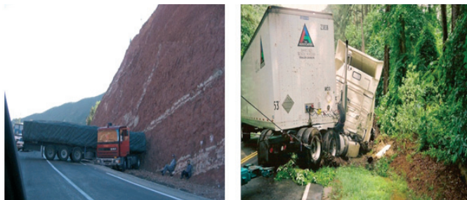
Picture 4. Jackknifing consequences

In most cases, when a trailer swing or jackknifing occurs, the driver is not able to control the movement of his vehicle or semi-trailer, as both of these occur suddenly. The consequences of these phenomena can be milder if only a part of the articulated vehicle slides off the road, or very serious if there is a contact with another participant in the traffic or a rollover of the articulated vehicle.