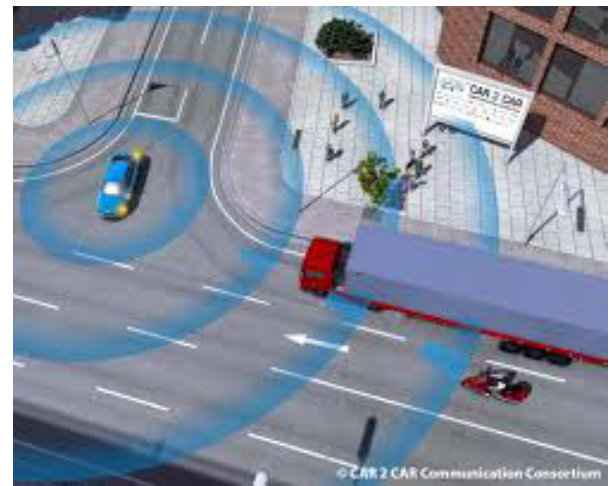
Picture 2. V2X communication

Widespread use of autonomous driving is still not a reality and will require a reliable, robust and extended wireless network. Promising high data rates and very low latency, 5G is the future of autonomous vehicles. With the implementation planned as early as 2020, vehicle communication or V2X communication (Vehicle-to-Everything) will enable vehicles to interact in real time with their environment to increase road safety, traffic efficiency and energy savings (picture 2.).