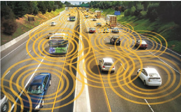
Picture 4. Communication between vehicles

The sensors are used to implement car-to-car communication for automated driving. This includes, for example, intelligent camera and radar systems (picture 4.), which allow direct data exchange between cars. However, these systems have key physical deficiency. They can neither look around corners, nor over hills, nor through obstacles. That is why they limit the work of self-driving cars. This simple form of automatization is also inappropriate at higher speeds.