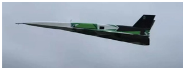
Fig. 1. New model of hypersonic aircraft of the company "Destinuis"

Recently, an increasing number of the most important companies from the aviation industry have been investing significant funds in research and the possibility of using green hydrogen as a propellant, putting decarbonization in the foreground. Swiss startup Destinuis is developing a hypersonic passenger plane with hydrogen engines.