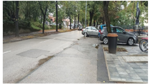
Figure 5. Intersection Srpskih vitezova Street-Kozarska Street (view to the right)