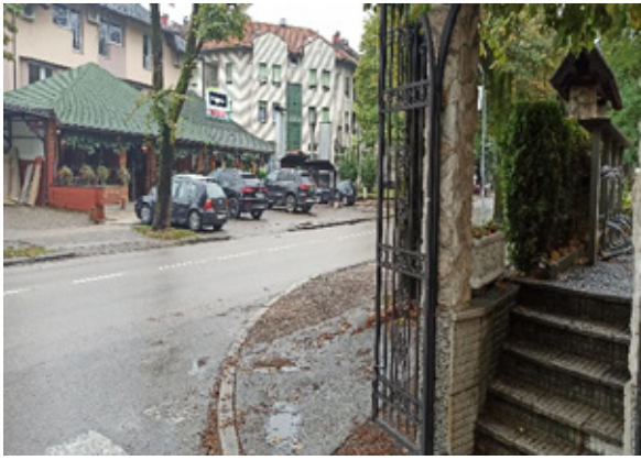
Figure 2. Intersection Filip Macura Street-Kozarska Street (view to the right)