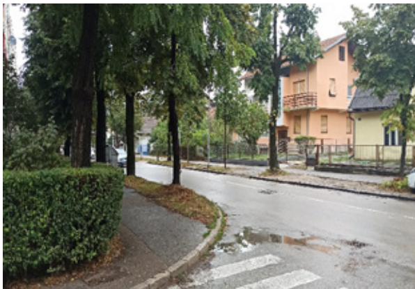
Figure 3. Intersection Filip Macura Street-Kozarska Street (view to the left)