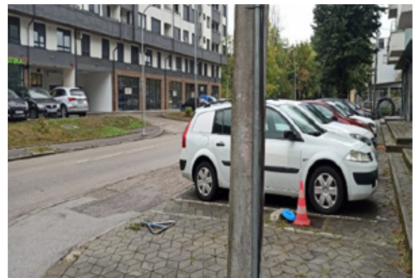
Figure 6. Intersection Miće Radakovića Street-Kozarska Street (view to the right)