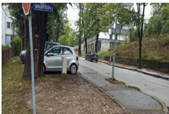
Figure 4. Intersection Srpskih vitezova Street-Kozarska Street (view to the left)