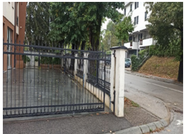
Figure 7. Intersection Miće Radakovića Street-Kozarska Street (view to the left)